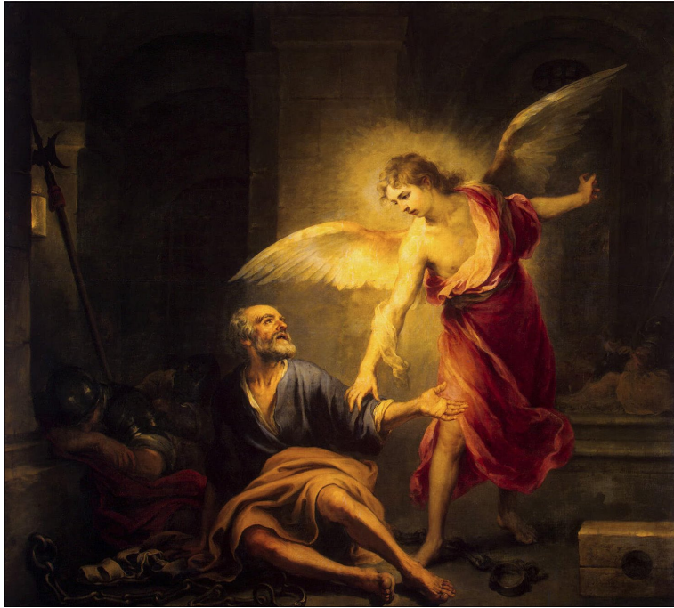
Liberation of St. Peter by Bartolomé Esteban Murillo (1617-1682)